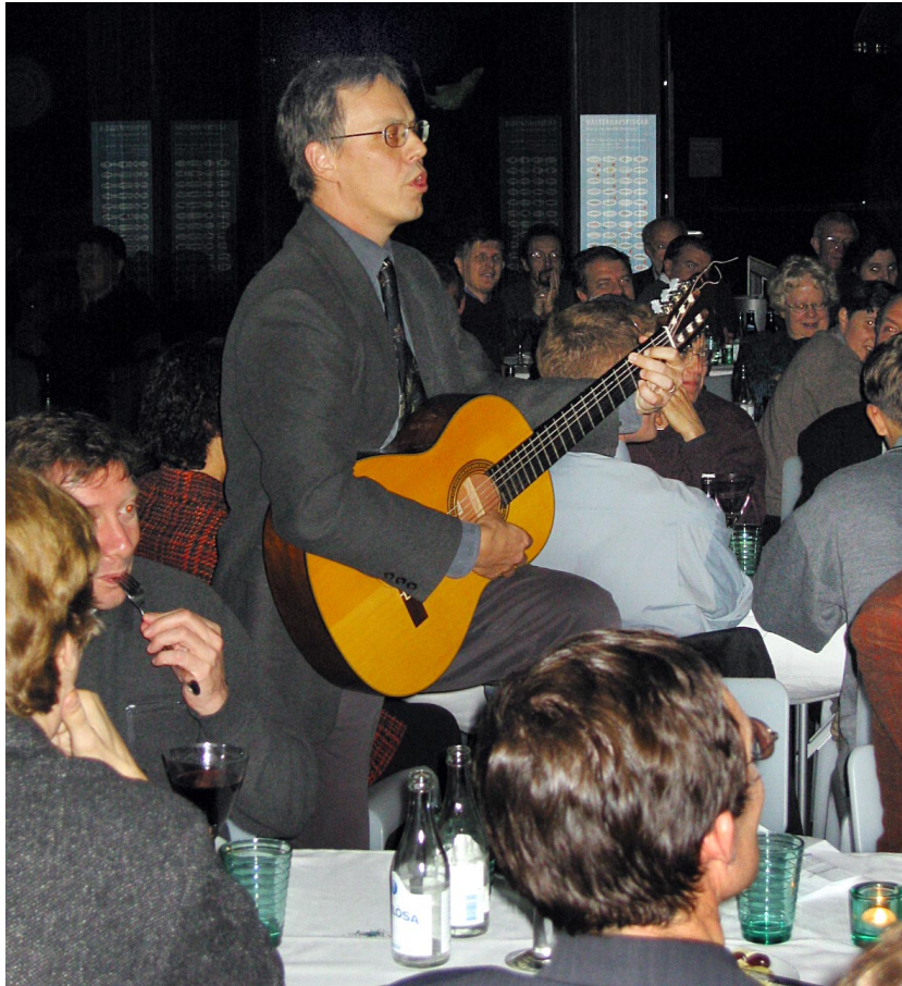
Entertainment by Håkan Pleijel (see song text on page 375).