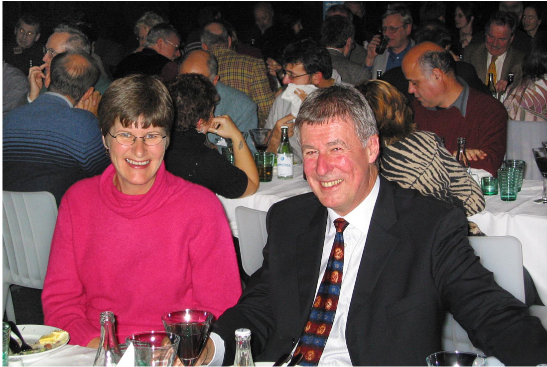
At the Conference Dinner in the Aquarium Hall at the Universeum Science Museum.