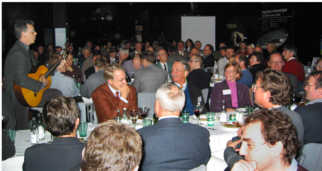
At the Conference Dinner in the Aquarium Hall at the Universeum Science Museum.