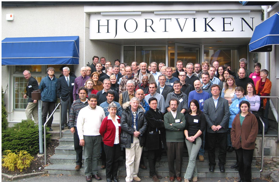
Some of the workshop participants gathered outside the entrance of the Hjortviken conference centre in Hindås, outside Gothenburg.