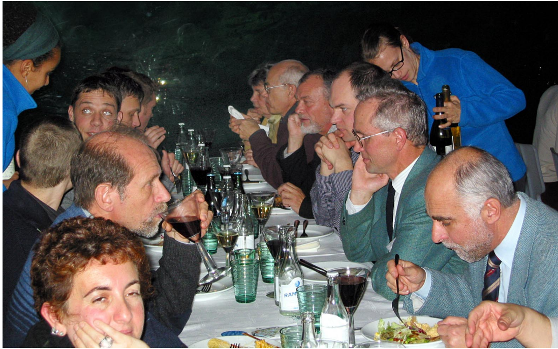
At the Conference Dinner in the Aquarium Hall at the Universeum Science Museum.