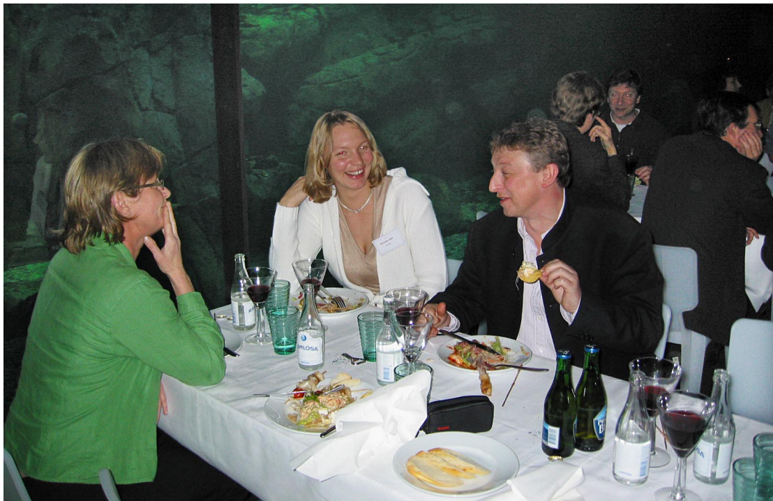
At the Conference Dinner in the Aquarium Hall at the Universeum Science Museum.